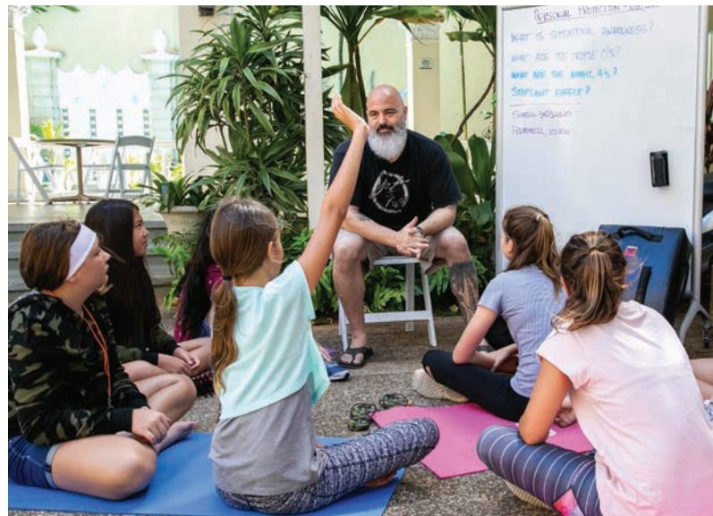
MCBL's initiatives for youth in 2019 included Girls Summit at YWCA Kokokahi (left) and Girls Summit Youth held at YWCA Laniākea (above).

The women leaders of tomorrow are nurtured and mentored as our youth today. MCBL connected key professionals in the community with girls in middle school and high school through its Girls Summit and Girls Summit Youth programs in 2019.