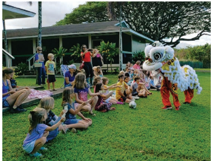
Family-friendly fun at YWCA Kokokahi in 2019: Day at the pool (left), archery class (top) and a lion dance for homeschool students (above).