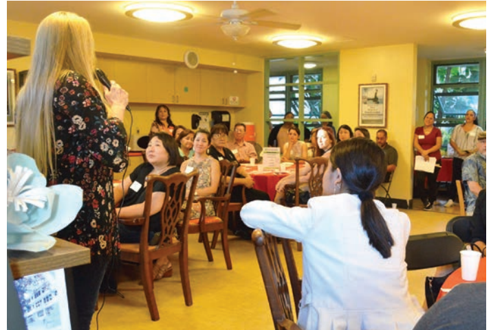
The Fernhurst Open House event on August 13, 2019, was an opportunity for Fernhurst residents, staff and graduates to connect with donors and supporters. A Fernhurst resident (above) shared her personal story of working toward a better life after coming out of prison.